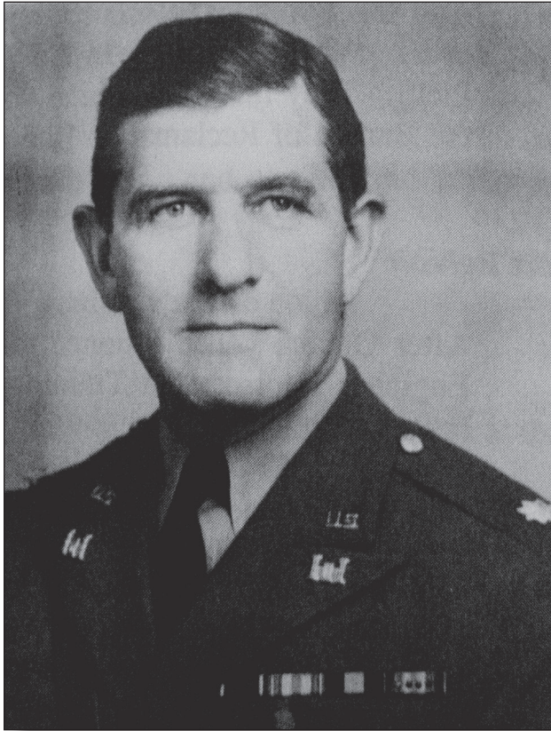
Lieutenant Colonel William M. Hoge served as first commander of the ERTC.

units, and an assembly line approach to production. The design for the enlisted men's barracks was developed during the 1930s by Works Progress (later Work Projects) Administration architects and draftsmen as part of a project to update the World War I cantonment plans. They were built of wood because ". . . American experience held that a war period was always a temporary period." These barracks were rectangular buildings, measuring 30 by 80 feet, with two stories, nine bays, and asphalt shingle-covered side gable roofs with projecting eaves. Each building covered a masonry foundation and included a single detached exterior side chimney. There were first- and second-floor entry porches in the gable end and dual side entries with entry porches. In addition to the barracks buildings, each complex included day rooms, organizational storehouses, and battalion storage buildings. Barracks buildings were designed to house 63- and 74-man units. A later type, designated "Modified Theater of Operations Type Construction," was adopted by the spring of 1942 as the shortages of materials began to be severely felt.